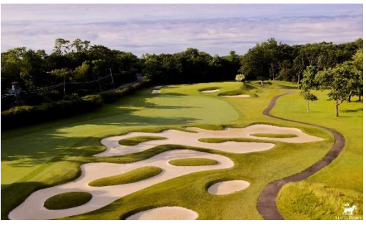
107th Met Open Championship