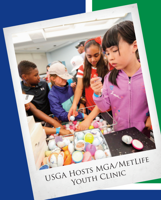
USGA HOSTS MGA/METLIFE YOUTH CLINIC