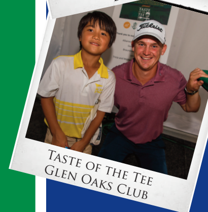
TASTE OF THE TEE GLEN OAKS CLUB