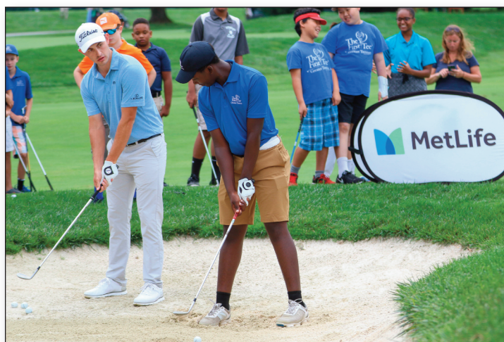
Bunker Lessons from Patrick Cantlay at Hollywood Golf Club.

Imagine a youth development program that links the science of golf, its history and traditions, and improved bunker play! All this was offered in the MetLife Youth Clinics this year to participants from the First Tee and NYC Parks Foundation. The USGA Museum and its Research and Test Center hosted an eager group of kids to lessons in science, technology and equipment in July. Later in the season Lexus ambassador and PGA TOUR winner Patrick Cantlay dug in to offer bunker play lessons at Hollywood Golf Club during the 102nd Met Open Championship to cap off a summer of fun and learning.