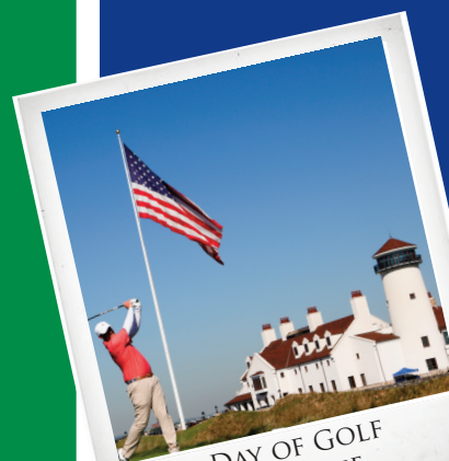
DAY OF GOLF BAYONNE