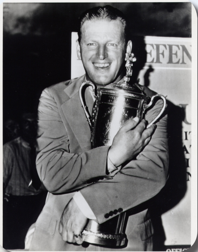
1940 champion Craig Wood

12 strokes – Al Mengert, 1960 11 strokes – Craig Wood, 1940