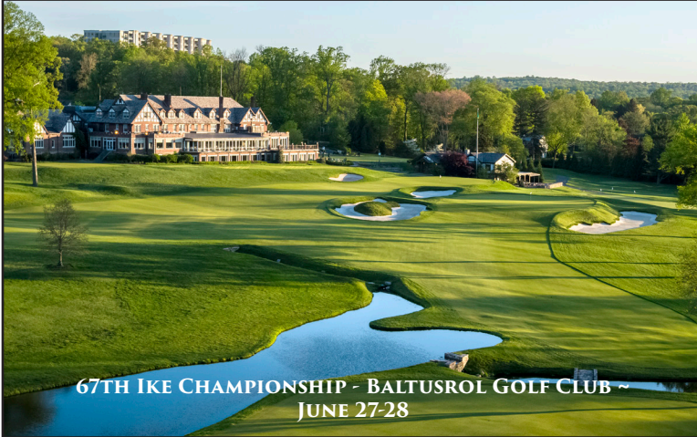
67TH IKE CHAMPIONSHIP - BALTUSROL GOLF CLUB ~ JUNE 27-28