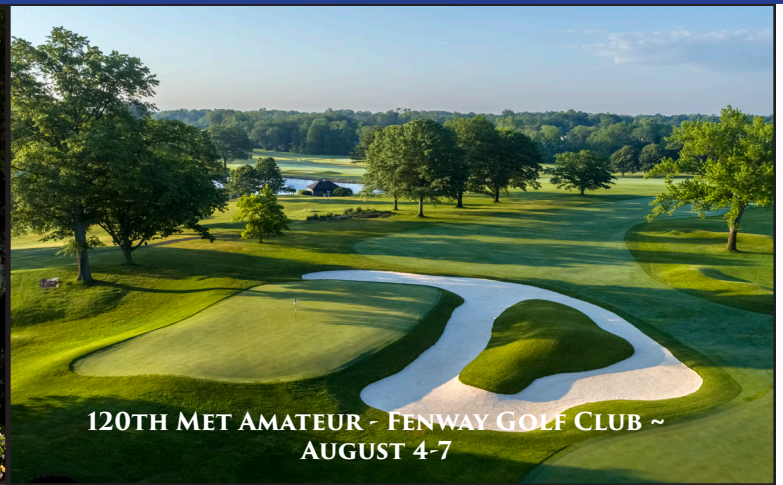
120TH MET AMATEUR - FENWAY GOLF CLUB ~ AUGUST 4-7