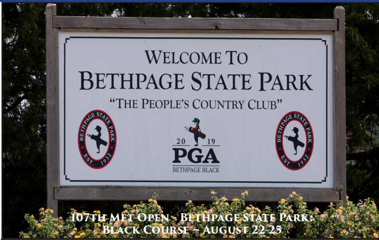
107TH MET OPEN - BETHPAGE STATE PARK BLACK COURSE ~ AUGUST 22-25