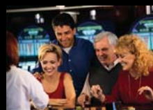
Eureka Hotel Casino Where the Players Win!