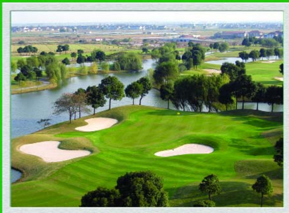
Shanghai Silport Golf Club

Enjoy a memorable China golf experience at Shanghai Silport