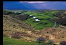
Wolf Creek #14