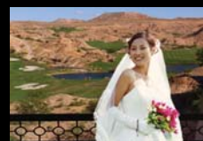
Weddings & Banquets

TO MAKE A RESERVATION, VISIT WWW.GOLFWOLFCREEK.COM OR CALL WOLF CREEK VACATIONS AT 866.252.4653