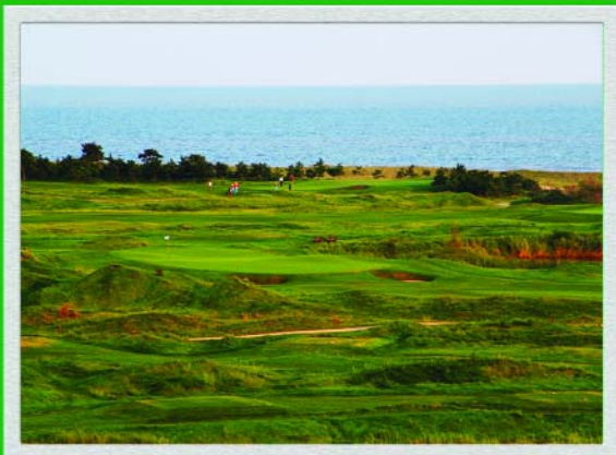
Tiger Beach Golf Links

An authentic Scottish-links experience in Asia awaits you at Tiger Beach Links