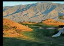
The Palmer Course

Now is the perfect time to experience the breathtaking beauty and challenge of Wolf Creek. By visiting www.golfwolfcreek.com , golfers can book tee times at this must-play course as well as the nearby Oasis Golf Club. They can also learn about Stay & Play packages that make it an especially great value to tee it up on Nevada's first ranked public course and enjoy accommodations at the Eureka Hotel Casino, where the players win! Located just an hour from Las Vegas, Wolf Creek is easy to get to but oh so difficult to leave.