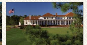
Pinehurst Resort www.pinehurst.com