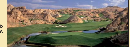
Right: Wolf Creek Golf Club Mesquite, Nev.