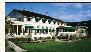
The Lodge at Pebble Beach www.pebblebeach.com

The annual Great Golf Resorts of the World Directory features exceptional golf resorts, covered in detail with over 200 breathtaking photographs, and it’s free.