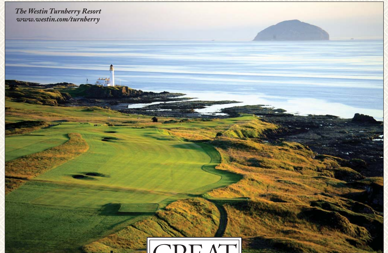
The Westin Turnberry Resort www.westin.com/turnberry