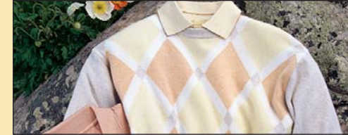
Left: Ben Hogan Apparel Denver, Colo.