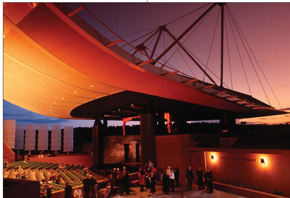
The Santa Fe Opera House provides an idyllic setting for music lovers.

Excellent holes abound at Black Mesa, but pay special attention to the engaging short par-four seventh with its risk/reward tee shot and baffling green, which features a pronounced left-to-right tilt. There is also the mesmeriz-