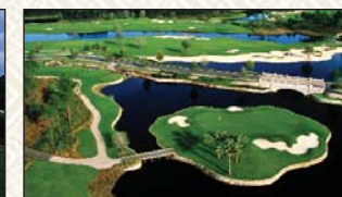
Ginn Hammock Beach Resort www.GinnHammockBeach.com