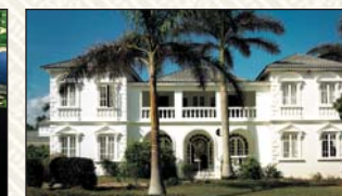
Half Moon www.halfmoon.com