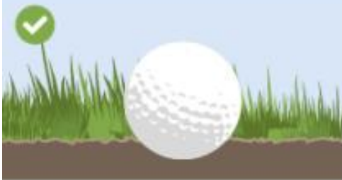
DIAGRAM 16.3a: WHEN A BALL IS EMBEDDED