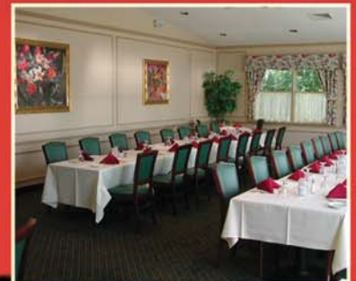
Superb Meetings & Conferences