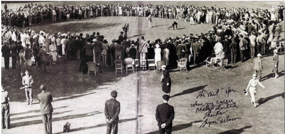
Byron Nelson putts for a full crowd at the 1936 Met Open at Quaker Ridge. "The 'Met' Open, where my career really started," Nelson wrote.