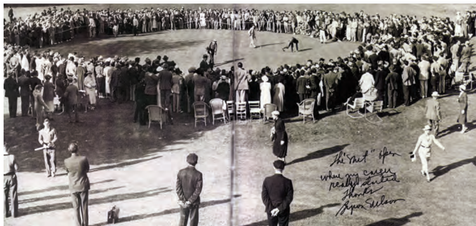
Byron Nelson putts for a full crowd at the 1936 Met Open at Quaker Ridge.