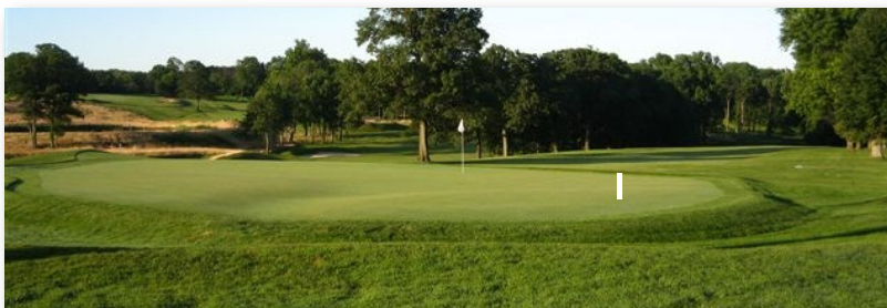
Essex County Country Club, Host of the 2016 Ike Championship