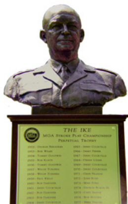
The Ike Championship boasts one of the MGA's most coveted trophies.